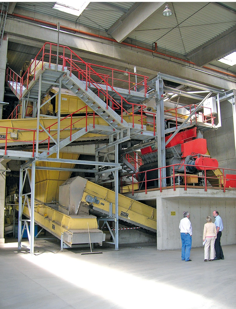
On-site mechanical waste pre-treatment