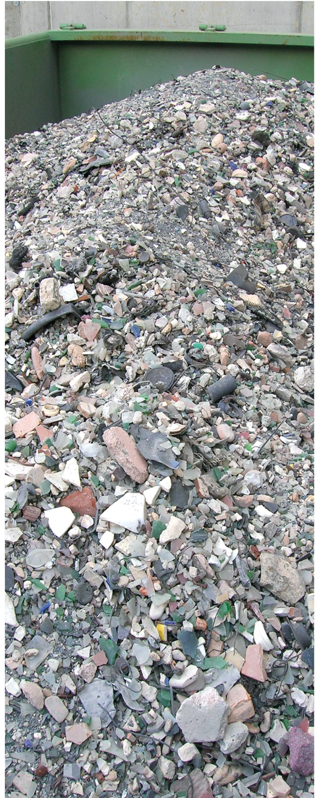
Example for optimized material recovery of residues from the fluidized bed incineration process: bed ash, i.e. coarse material, consisting of "sand-blasted" metals, glass, and minerals