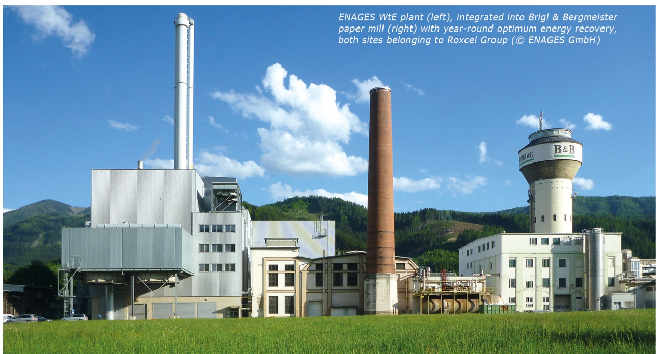
ENAGES WtE plant (left), integrated into Brigl & Bergmeister paper mill (right) with year-round optimum energy recovery, both sites belonging to Roxcel Group