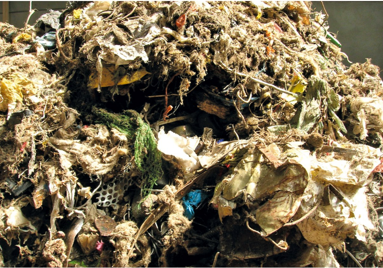
Example of inhomogeneous waste input material before mechanical pre-treatment